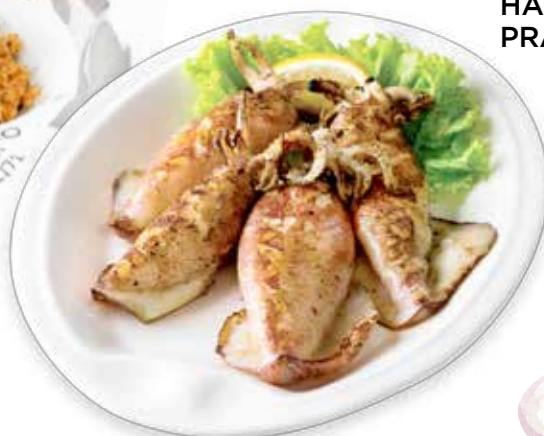
GRILLED SQUID 765