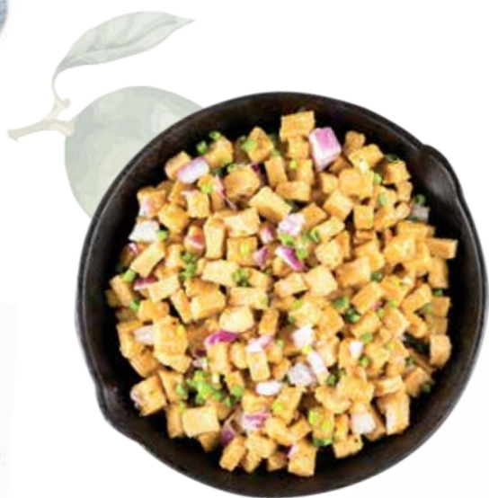
SIZZLING TOFU 200