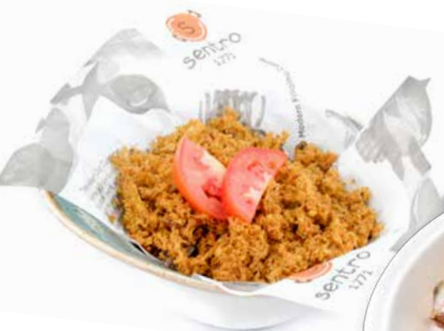
CATFISH ADOBO FLAKES 350