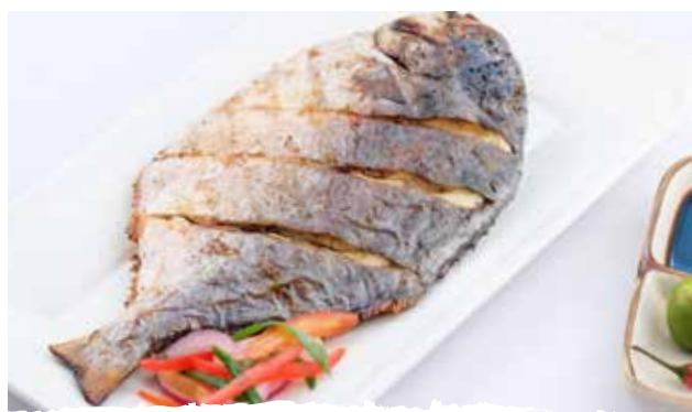
GRILLED PAMPANO 145/100 g