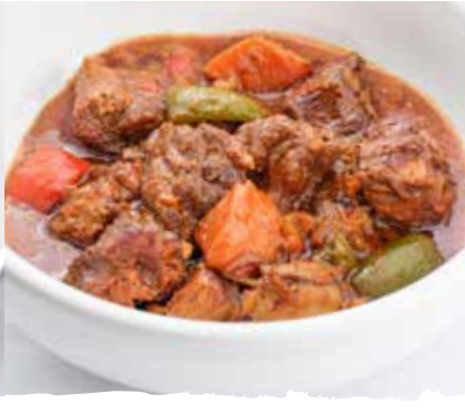
BEEF CALDERETA 780