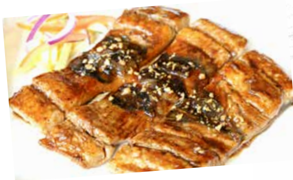
BLISSFUL BANGUS BELLY 730