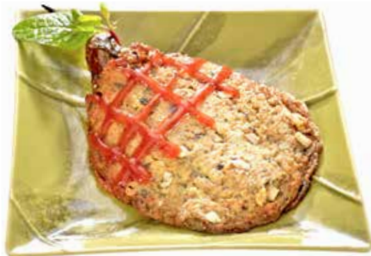
BANGUS EGGPLANT TORTA 390