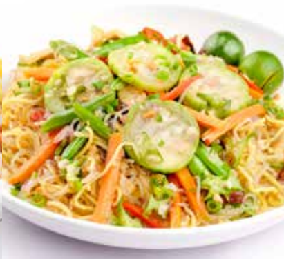
PANCIT BAM-I VEGETARIAN 300