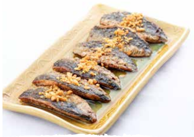
RATED GG 416