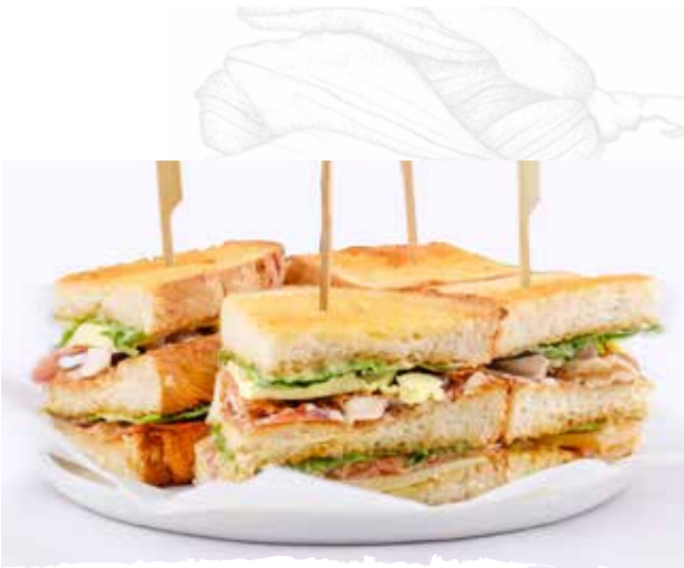
CAESAR DOUBLE DECKER SANDWICH 320