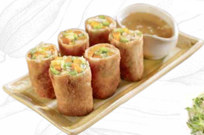
FRIED VEGETABLE SPRING ROLLS 450