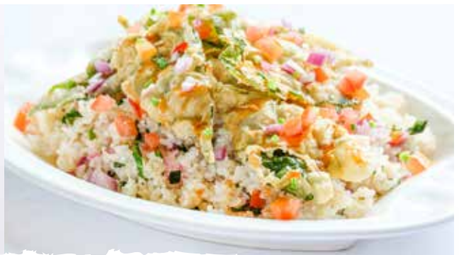
CRISPY KANGKONG RICE 350