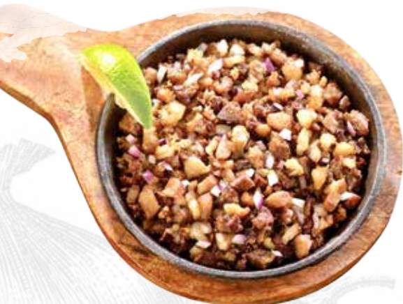
PORK SISIG 520