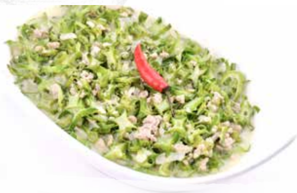
SENTRO GISING-GISING 325