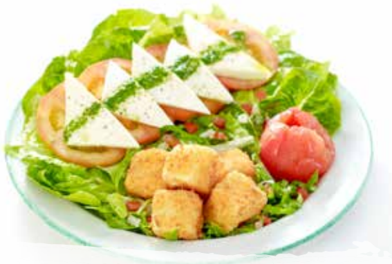
TOMATO KESONG PUTI SALAD 340