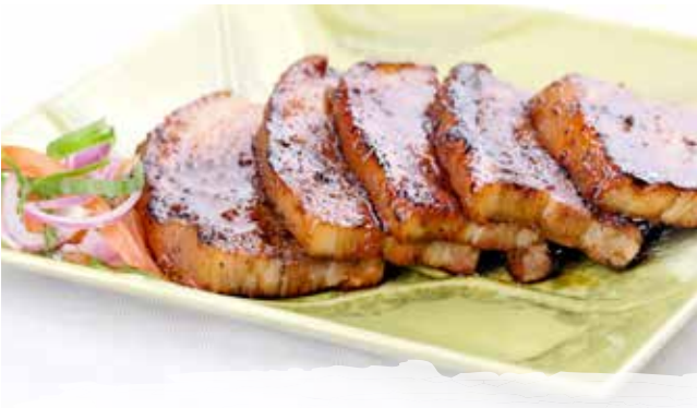
HONEY GARLIC SPARERIBS 790