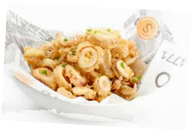
FRIED CALAMARI 630 🦑