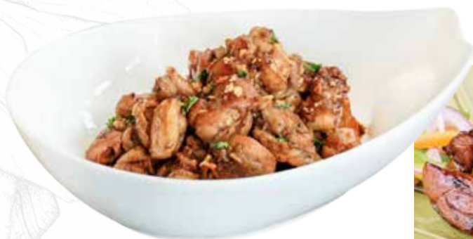
CHICKEN SALPICA0 440