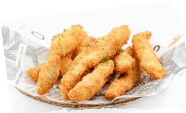
CHICKEN FINGERS 390