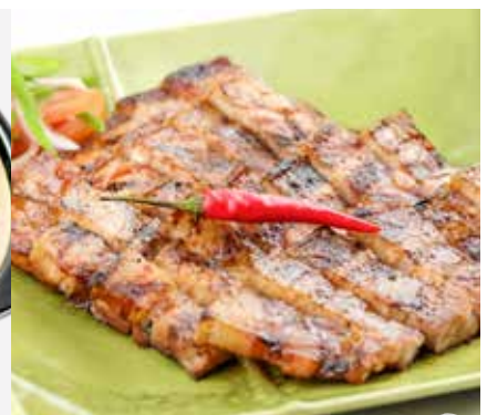
INIHWAN NA BABOY 500