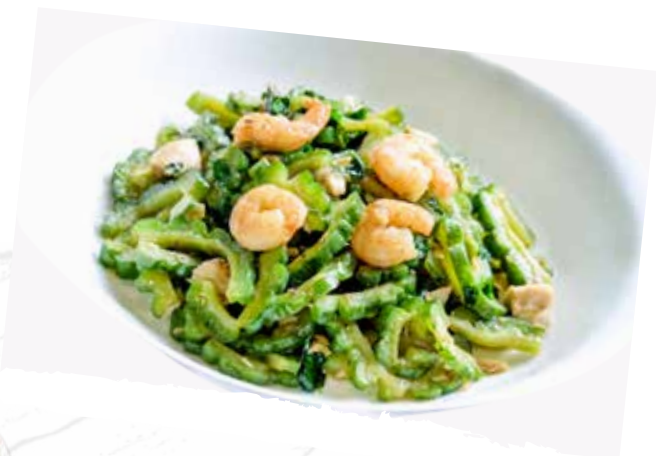
STIR-FRIED AMPALAYA & MALUNGGAY 290 🍤