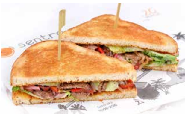
STEAK TIPS SANDWICH 495