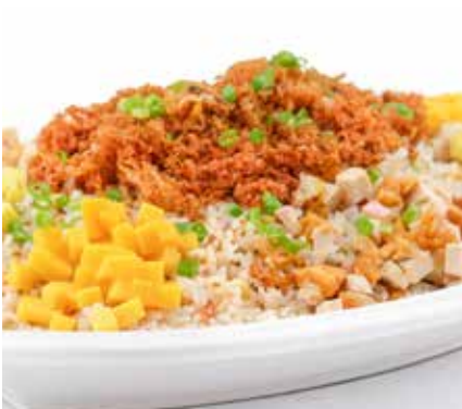
HITO FLAKES & SALTED-EGG FRIED RICE 475