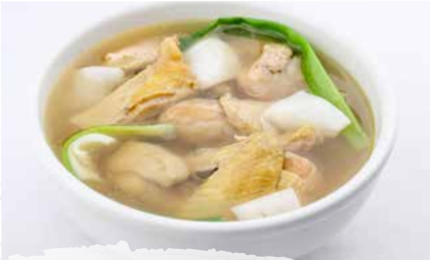
COCONUT CHICKEN SOUP 690