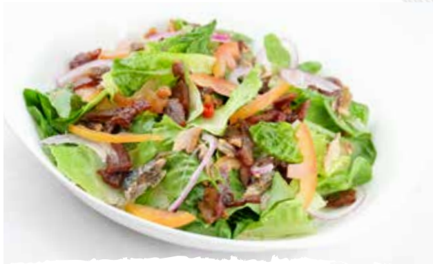
PINOY BEEF SALAD W/ TUYO VINAIGRETTE 350