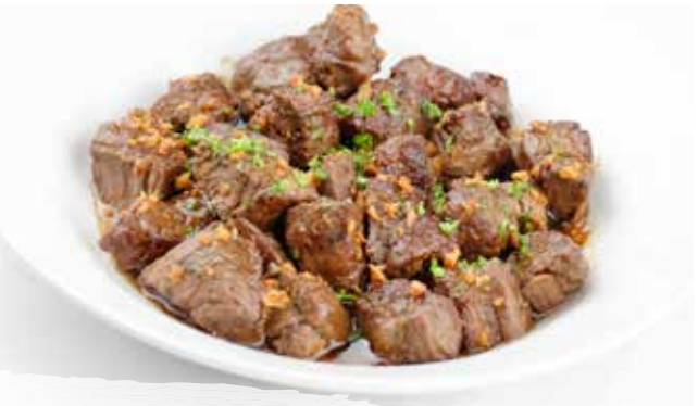
BEEF SALPICAO 1200