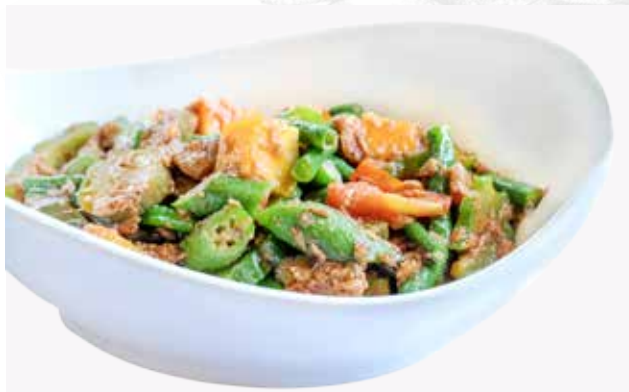
PINAKBET 300 🍤