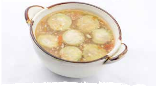
PATOLA SOTANGHON SOUP 150