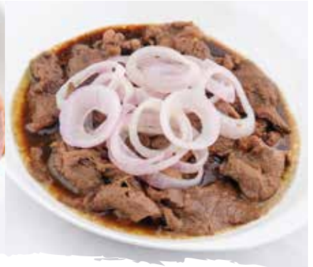
BISTEK TAGALOG 590