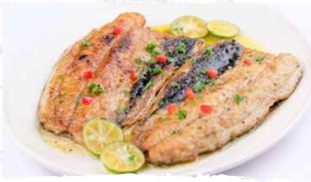
BANGUS W/ CALAMANSI BUTTER 730