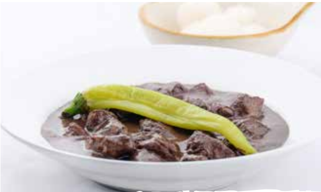
DINUGUAN SA SAMPALOK 370