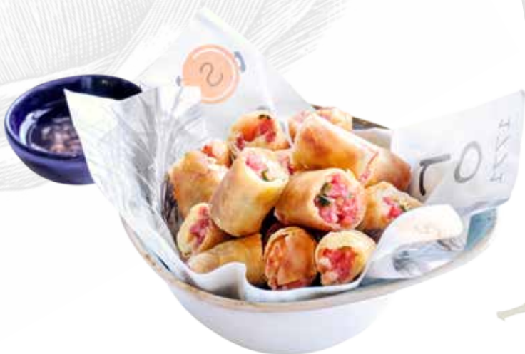
MACAU CHORIZO & CHEESE TIDBITS 443