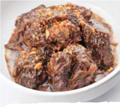
BEEF RIBS ADOBO 795