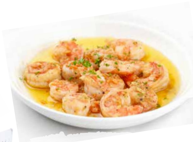
GAMBAS SENTRO 650 🦞