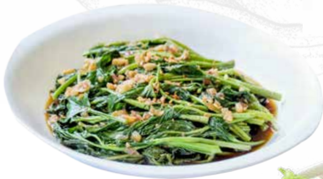
ADOBONG KANGKONG 200