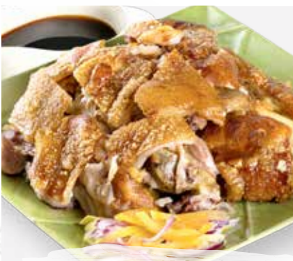
CRISPY PATA 105/100 g