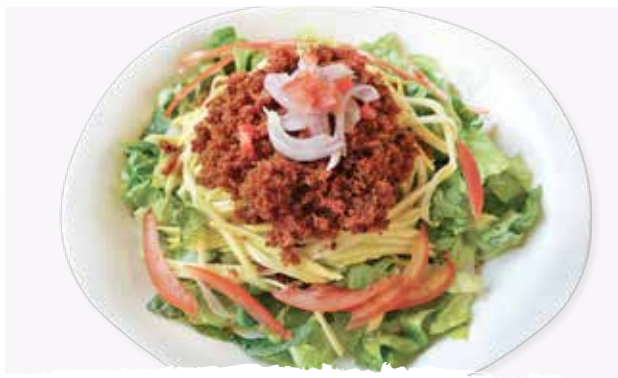
CRISPY CATFISH & GREEN MANGO SALAD 400