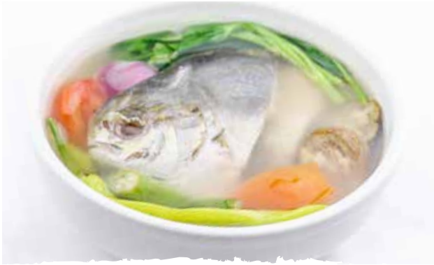
SINIGANG NA PAMPANO 150/100 g