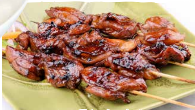
CHICKEN BARBECUE BONELESS 490