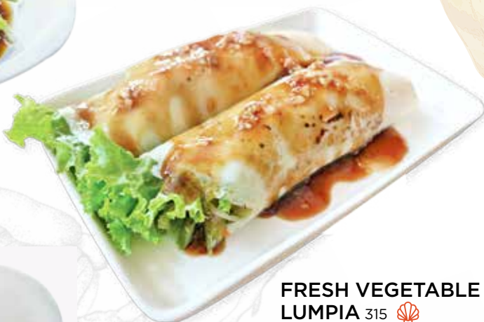
FRESH VEGETABLE LUMPIA 315 🍤