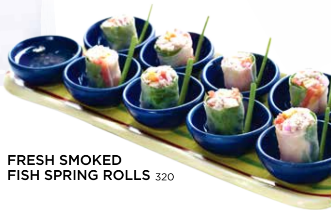
FRESH SMOKED FISH SPRING ROLLS 320