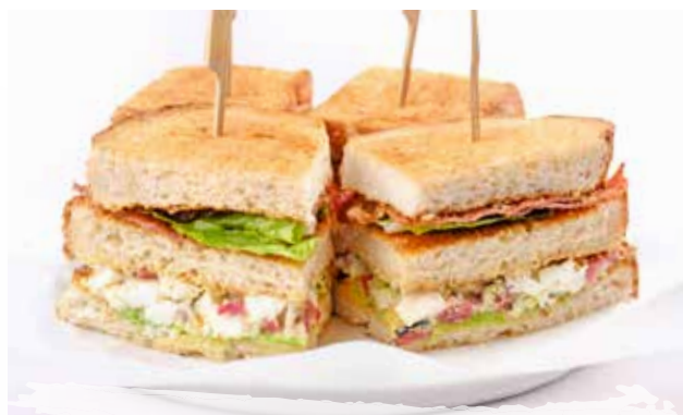
SENTRO CLUBHOUSE SANDWICH 425