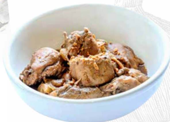
SENTRO CHICKEN ADOBO 580