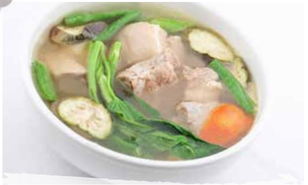
PORK SINIGANG 710