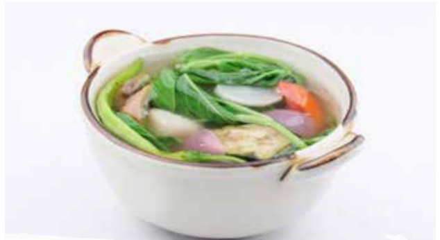
VEGETABLES IN TAMARIND SOUP 125