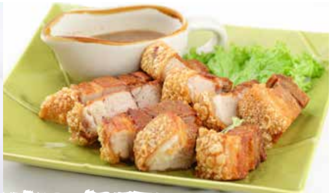
LECHON KAWALI 790