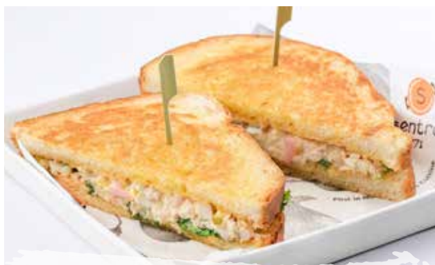
CHICKEN, EGG, & KALE SANDWICH 220