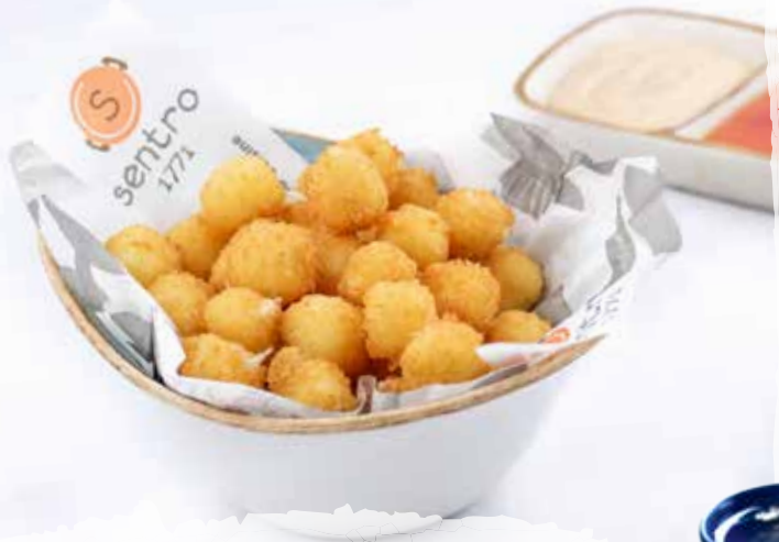
FRIED KESONG PUTI 530